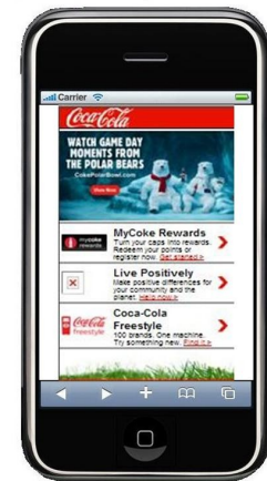
BEFORE (on left) and AFTER (above)