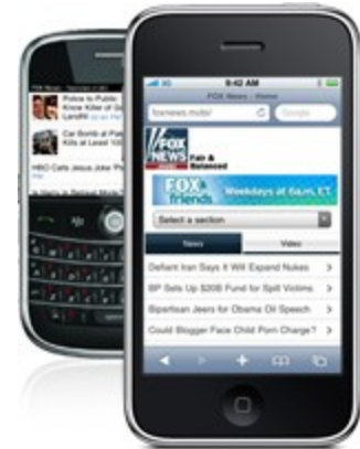
BEFORE (on left) and AFTER (above)