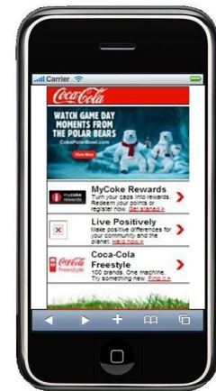
BEFORE (on left) and AFTER (above)